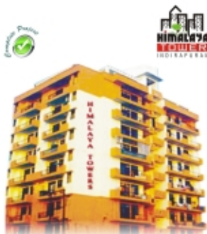
HIMALAYA TOWER - Indrapuram Near Delhi Public School, Completed in 2008