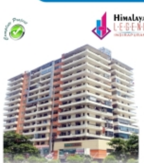
HIMALAYA LEGEND - Indrapuram Near Indrapuram Public School, Completed in 2011