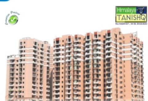
HIMALAYA TANISHQ - Raj Nagar Extn., Ghaziabad, Completed in 2015