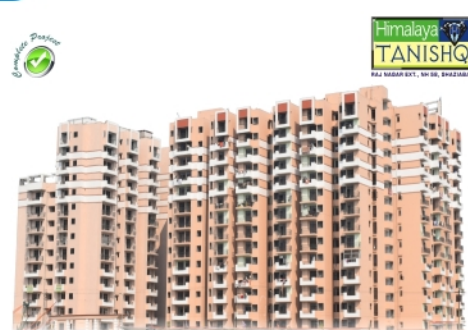
HIMALAYA TANISHQ - Raj Nagar Extn., Ghaziabad, Completed in 2015