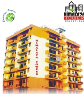
HIMALAYA TOWER - Indrapuram Near Delhi Public School, Completed in 2008