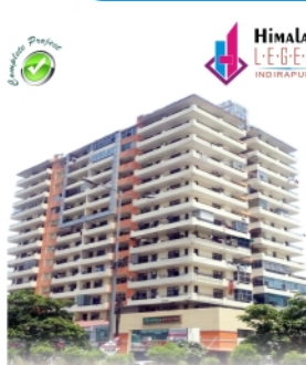
HIMALAYA LEGEND - Indrapuram Near Indrapuram Public School, Completed in 2011