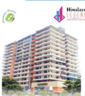
HIMALAYA LEGEND - Indrapuram Near Indrapuram Public School, Completed in 2011