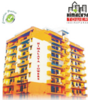
HIMALAYA TOWER - Indrapuram Near Delhi Public School, Completed in 2008