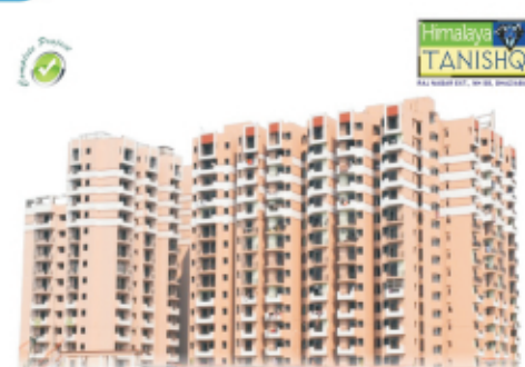
HIMALAYA TANISHQ - Raj Nagar Extn., Ghaziabad, Completed in 2015